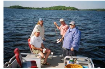
Using a Sechhi Disk to measure water clarity– an important factor for aquatic plant growth.

The Flowage was sampled in four locations representing different aquatic environments and water depths. The water was sampled for clarity, dissolved oxygen profile, temperature, and chlorophyll A (presence of algae). Sediment samples to determine the extent of heavy metals were also taken due to concern about mercury levels in the Flowage.. The samples were done with scientific precision to insure accuracy and will be analyzed at the Wisconsin Lab of Hygiene. Sampling will be repeated later this fall for comparative data..