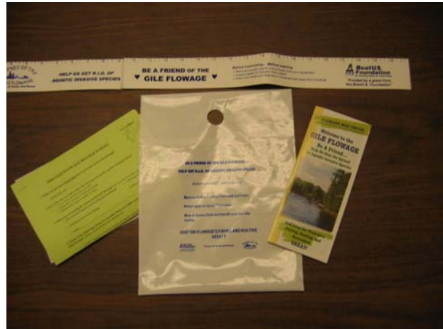
The Boater Welcome Kit features the new full color Gile Flowage map-brochure, litter bag, and fish ruler to remind boaters to R.I.D. the Flowage of aquatic invaders from hitch-hiking a ride on their equipment

The kits contain handy items designed to encourage boaters to help stop the spread of aquatic invasives into and out of the Flowage. They include a Gile Flowage map-brochure, a 27-inch adhesive fish ruler, and fact sheet about FOG; all held in a litter bag. Some kits also include a postage paid confidential boater survey designed to get feedback from boaters on how FOG about their interests.