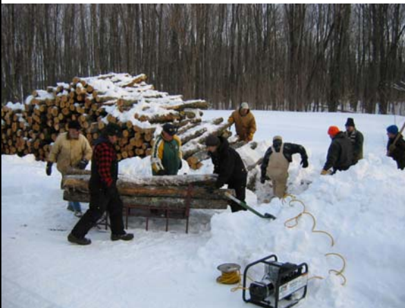
A portable generator came in handy to drill holes in the fish crib timbers. Despite the snow, the project was a great success.

The cribs will serve as artificial nursery areas for young game fish and will help improve fishing on the flowage. Because the Gile Flowage lacks natural structure needed for fish production, construction of fish cribs has been a priority for FOG.