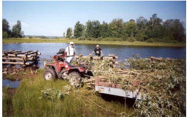
FOG members cut brush for the 2006 fish crib project. FOG has installed 29 fish cribs to benefited the Flowage's fishery.

Records show that many of the cribs built during the 1930's remain intact today except for the brush component which deteriorates with time. On some projects divers have been used to re-brush old cribs to revitalize their effectiveness. However, the standing log structure alone still provides valuable fish habitat for countless years. Knowing that these are long-lasting improvements provides motivation to the construction crews who work allot of hours in adverse conditions building the cribs during the winter months.