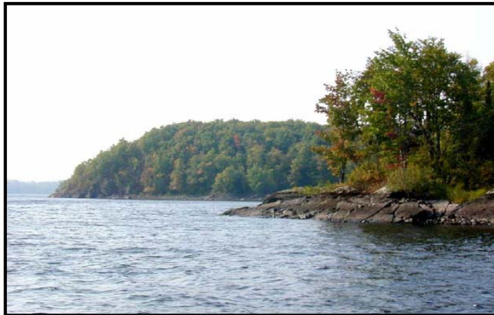
Gile Flowage September 2005